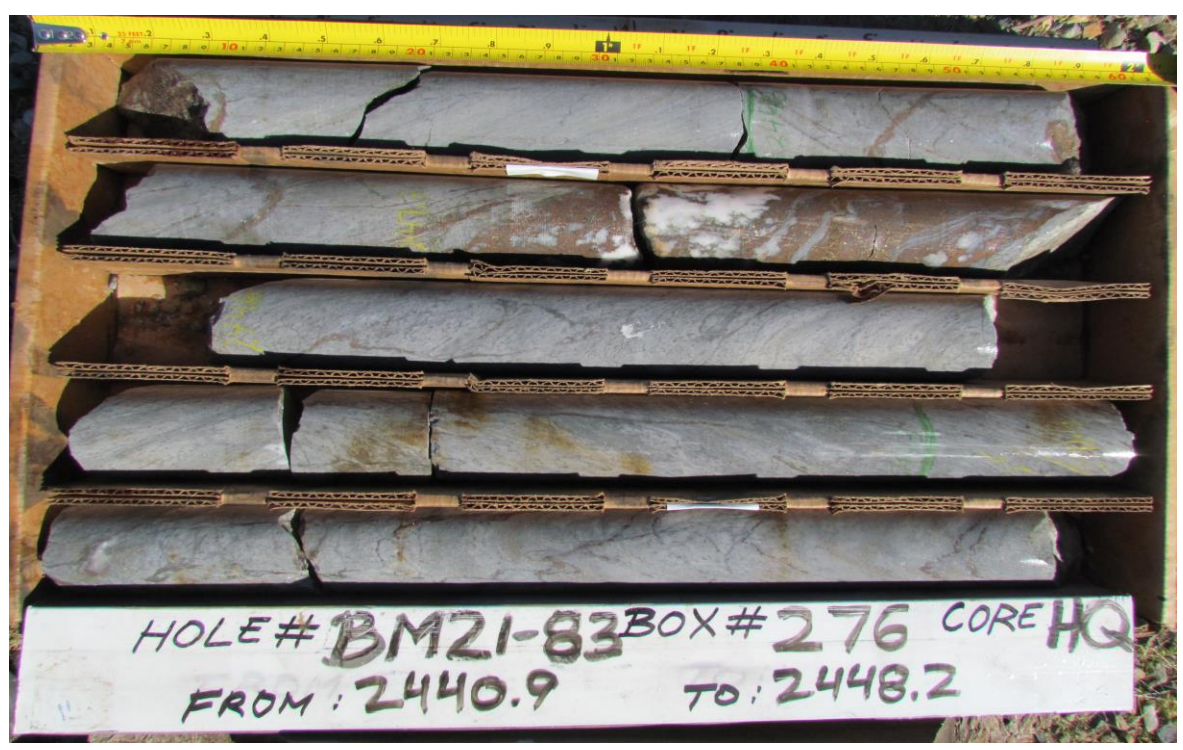
Photo from Mineral zone of BM-83hole depth 2,440.9 feet. Red brown mineral is sphalerite. Brassy mineral is Chalcopyrite.